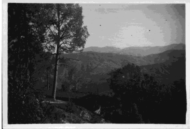
← Ranikhet - view from pharmacy

1942 - posted to Lucknow as a wardmaster (excessively hot weather so pleased to be posted to cooler Ranikhet).