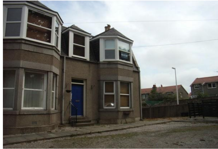
On an estate agent's website around 2000.