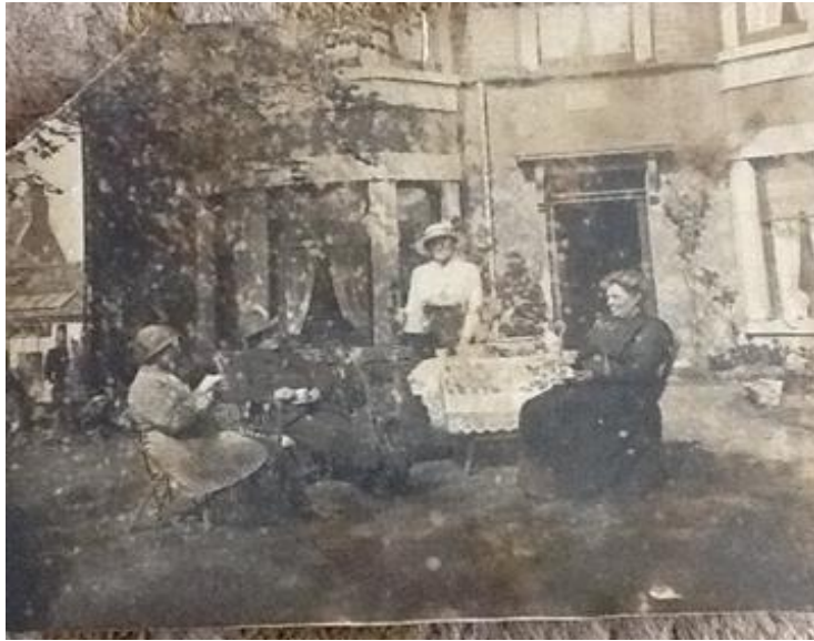
House was built in 1904.