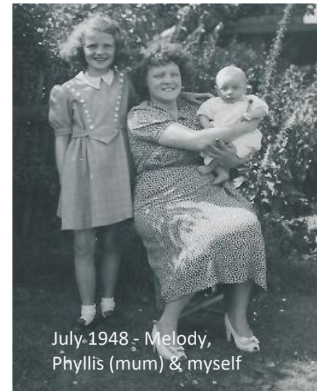
July 1948 - Melody, Phyllis (mum) & myself