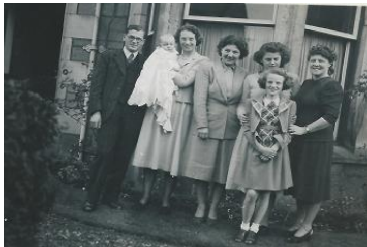
All outside the bay window of 36 Broadstone Park, Inverness