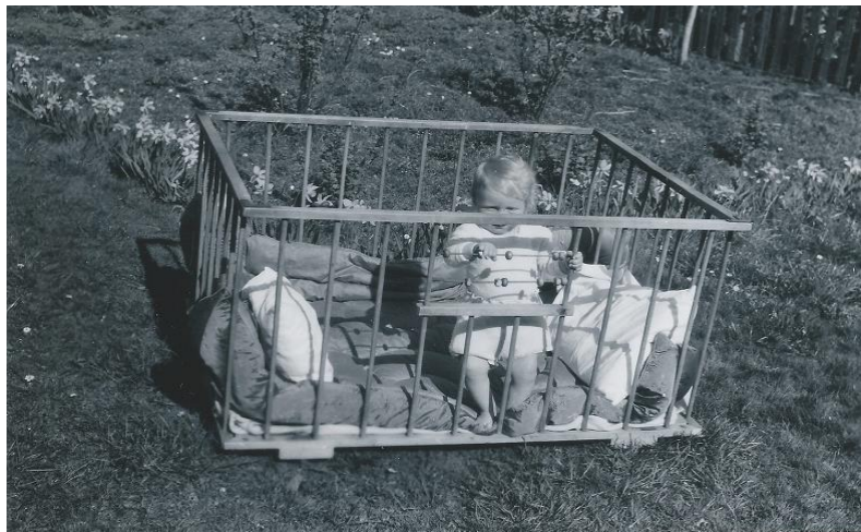
Norman in play pen aged 13 months