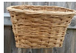
Still have the basket - 9 May 2021 - 68 years later!