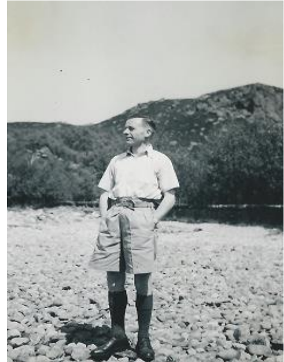
Dad - Loch Duntelchaig 3 June 1951