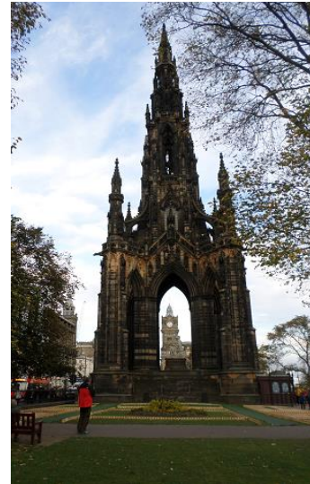
Scott Monument - 2018

Mum took the 1957 photo with the North British Hotel lined up through the arch - same shot 61 years later. No direct influence - I only discovered the 1957 photo in 2021.