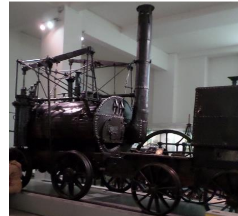
"Puffing Billy" locomotive c 1814 - photographed on 19 May 2021. The only item I could find from my 1961 visit.