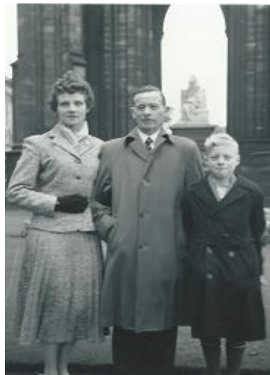
Scott Monument -1957