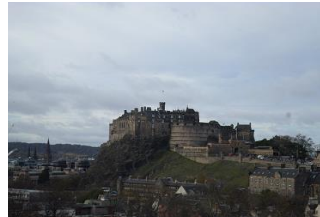
View of castle from roof garden of National Museum - 25 Sept 2014

For many years I found I could not climb to the top of the Scott monument then in 2007 found it was not the height but the turning round and round to go up. Written on the back of this 12 Sept 1957 view of the Art Galleries and Castle is "taken by Norman from Scott Monument" - what a surprise!