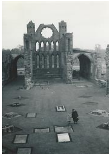
Elgin Cathedral 01-Nov-50

I have written books and created websites about Pictish Symbol Stones, what the symbols mean and the use of the Stones as a "shared space" for different beliefs.