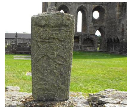
When in Elgin I climb the tower to look at the cathedral and countryside. This is a Class 2 Pictish "Transition" Stone.